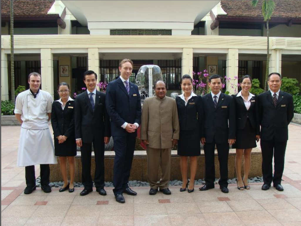
Indian Minister of Defense in October 2010