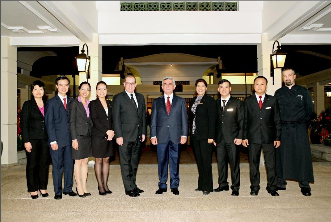
Armenia President in June 2012