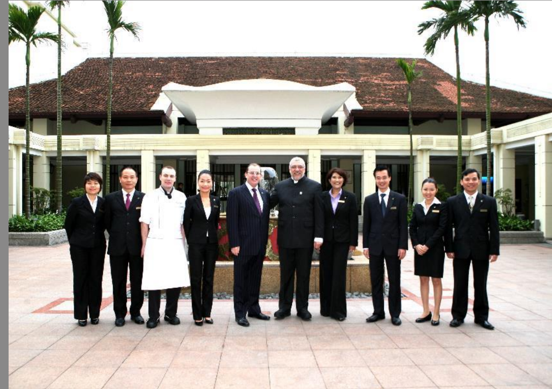
Paraguay President in March 2011