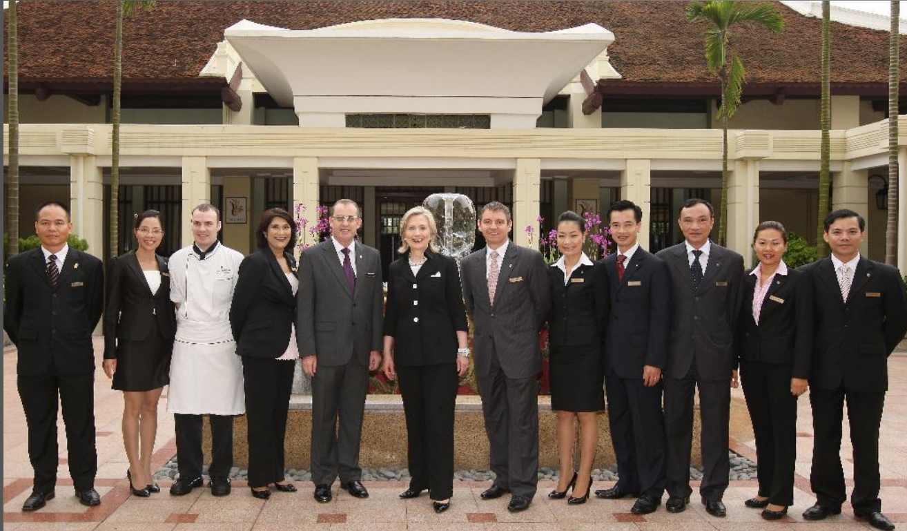
U.S. Secretary of State In July 2010