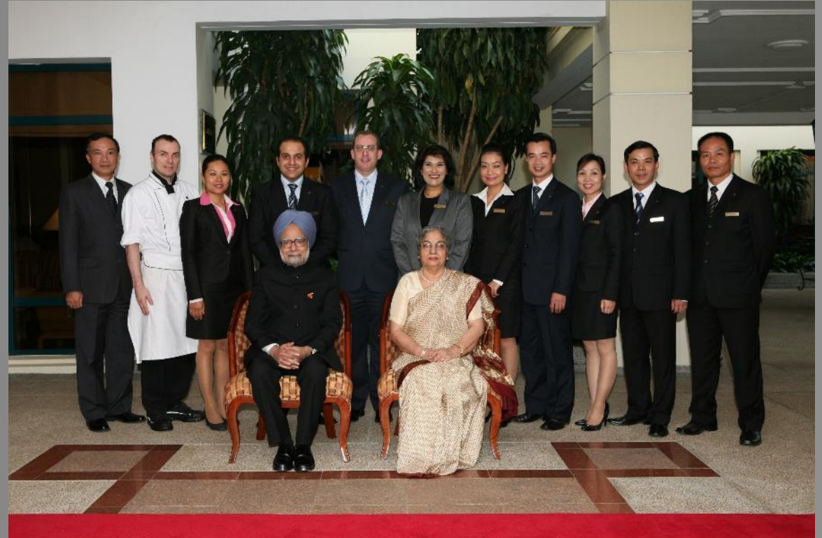
Indian Prime Minister in October 2010