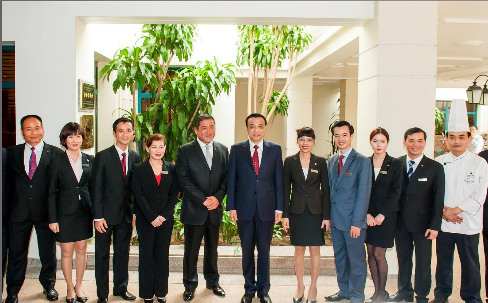
Chinese Prime Minister Delegations in October 2013