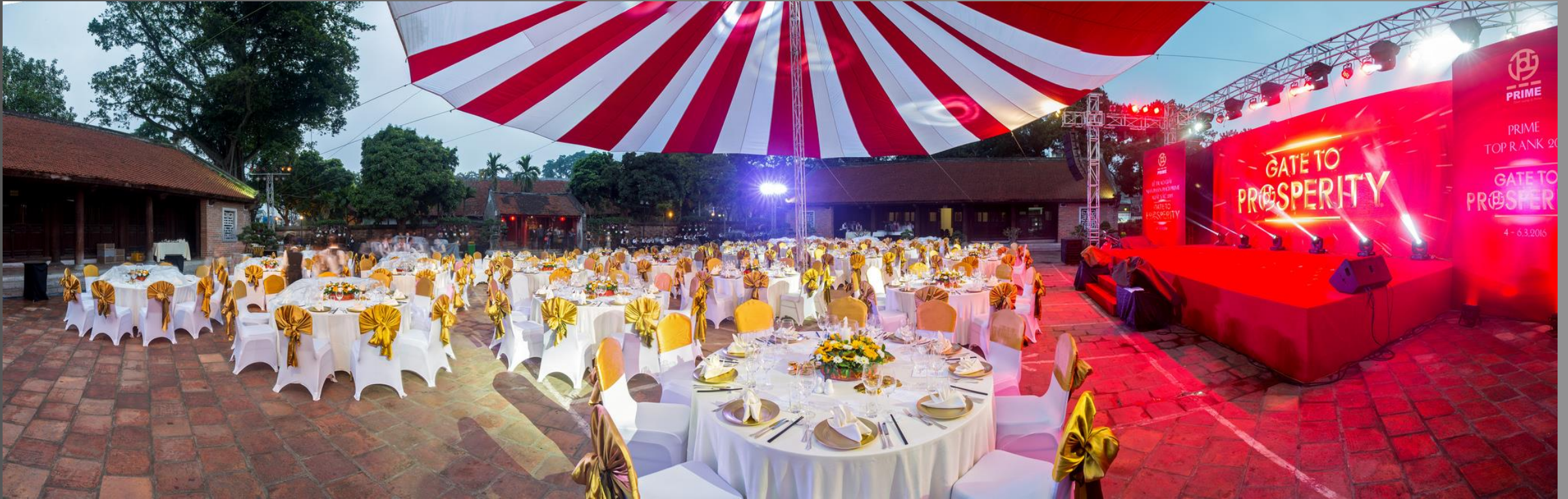
Primer Gala dinner at Van Mieu