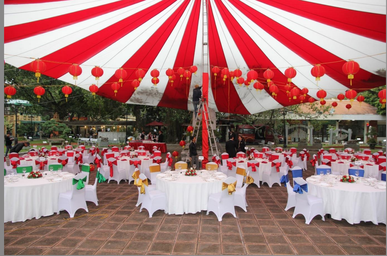
Gala Dinner at Historical Musium