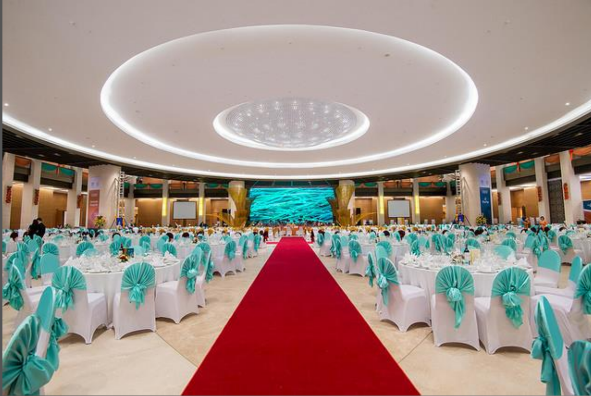
IPU Gala dinner for 1700 guests