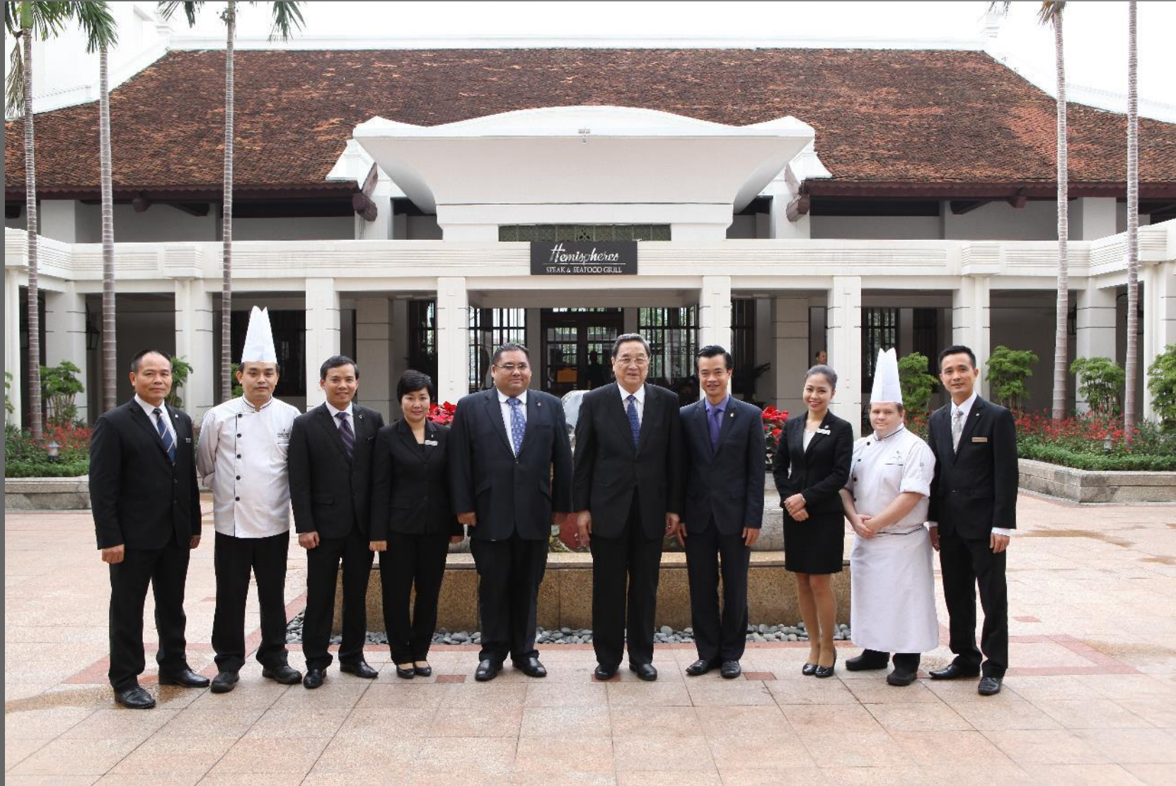
Communist Party of China Delegations in December 2015