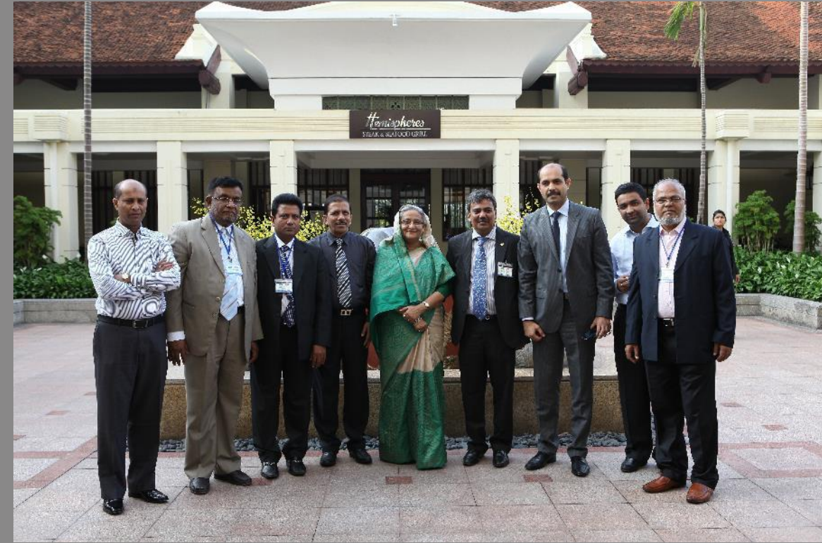
Bangladesh Prime Minister in November 2012