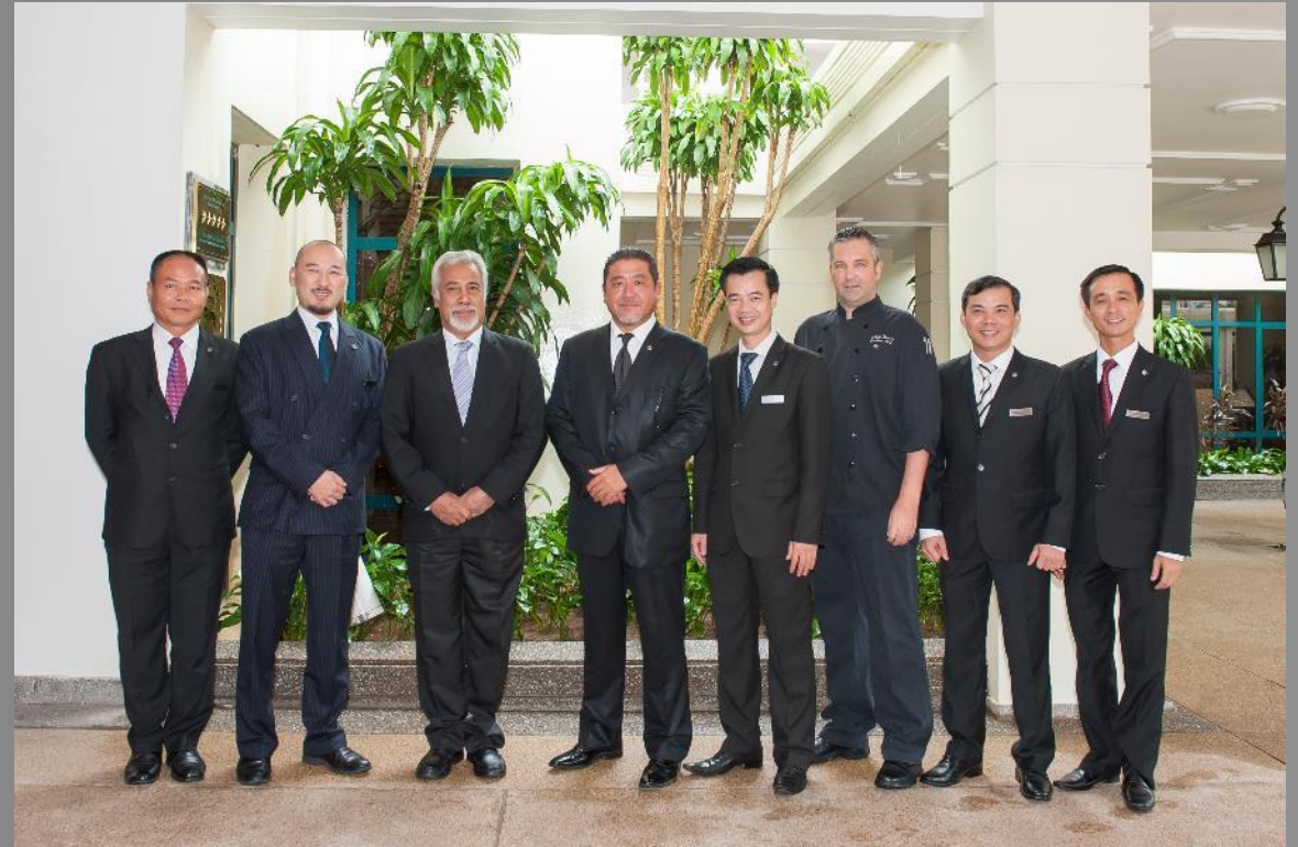
Timor Leste Prime Minister In September 2013