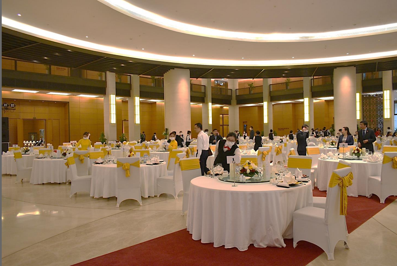
Gala dinner at National Assembly Palace