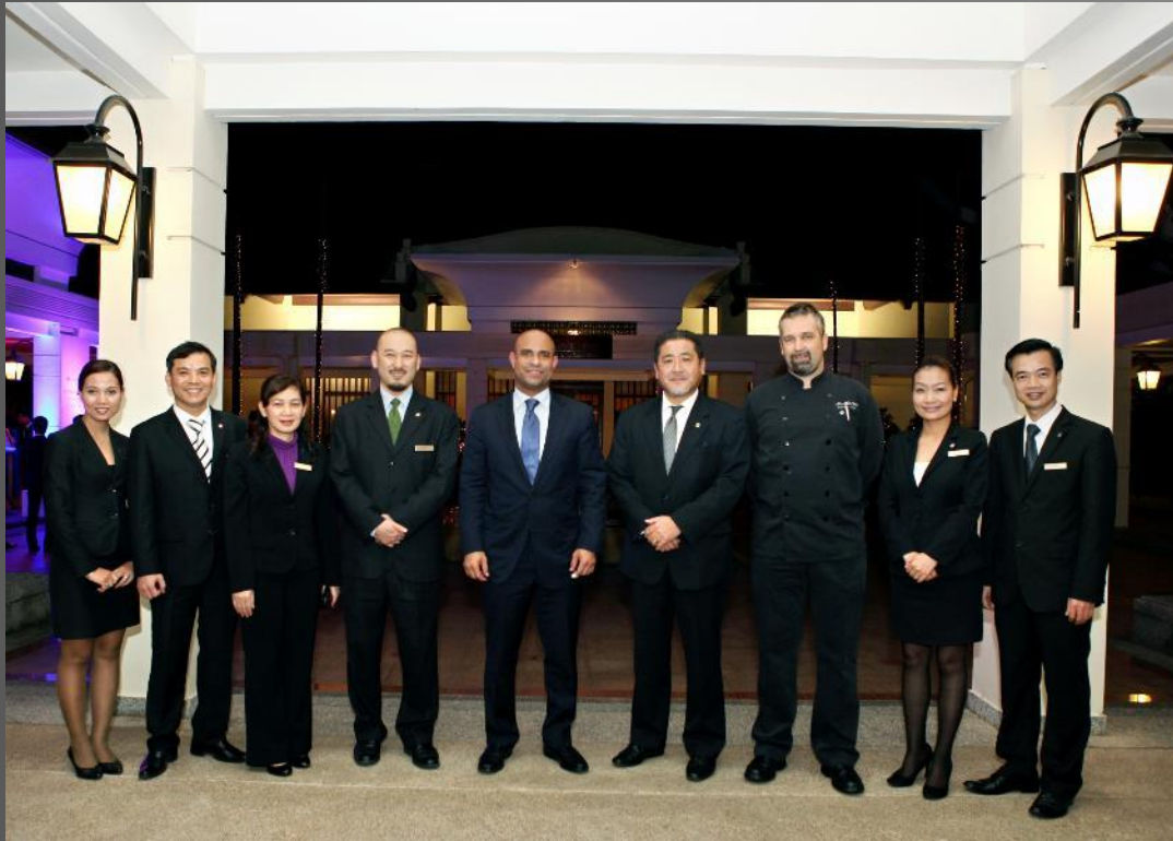
Haiti Prime Minister in December 2012