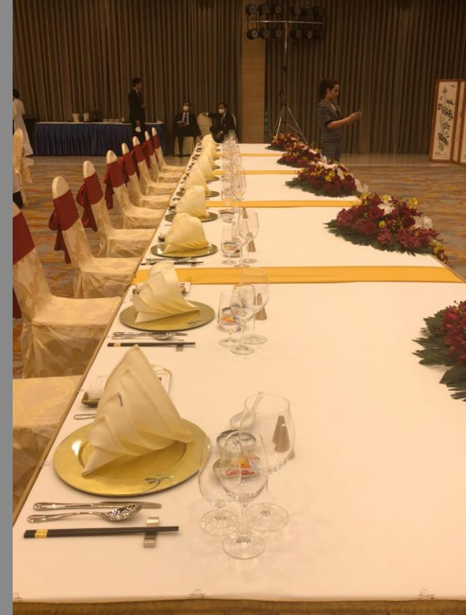
Outside catering at International Convention Center for Head of State