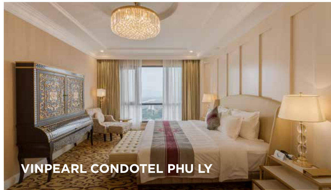
VINPEARL CONDOTEL PHU LY

Lying gracefully on the Red River Delta, Ha Nam is famous for its idyllic, pristine charm and cultural-tourist sites being history themselves. The place manages to preserve many traditional craft villages and festivals and still boasts its iconic cultural beauty while changing and progressing day by day.